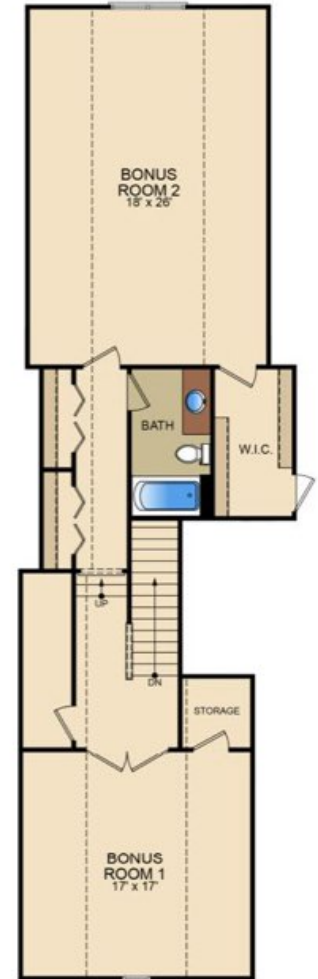
DOUBLE BONUS ROOM